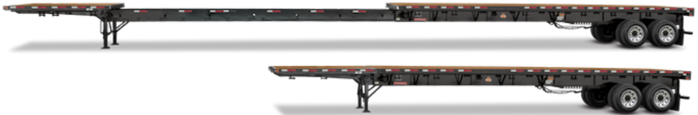
XTP5390SA3 Base Model (Note: Options not shown)