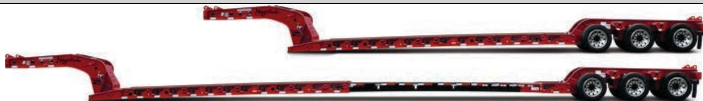
MAGNITUDE 55MX Base Model (Note: Options not shown)