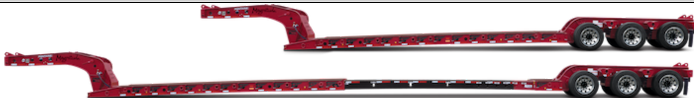
MAGNITUDE 55MX Base Model (Note: Options not shown)