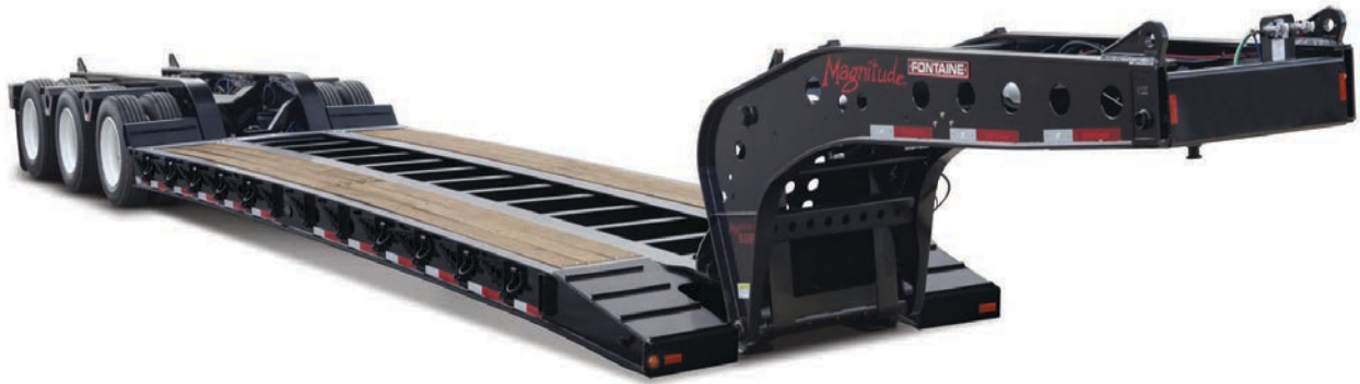
MAGNITUDE 55H FLD 26 Base Model (Note: Options not shown)