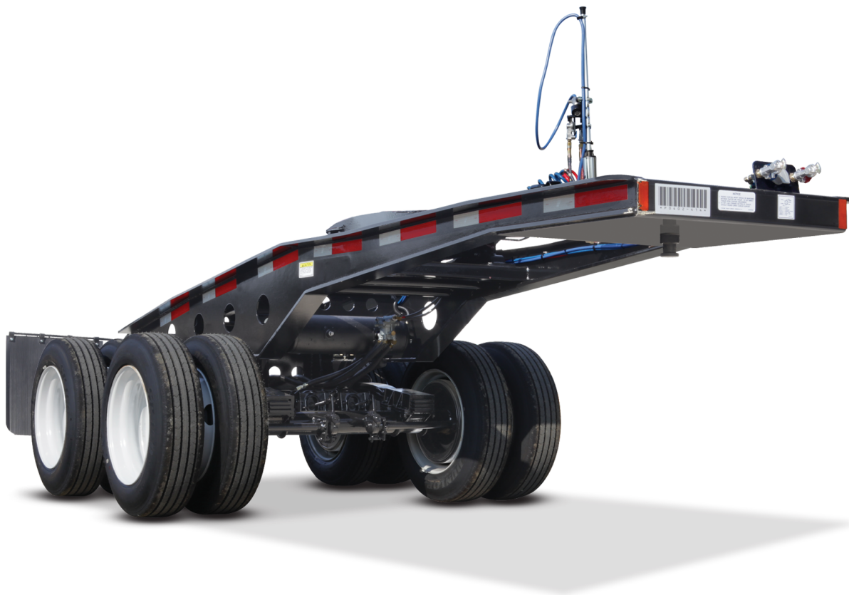
Jeep 302 Base Model (Note: Options not shown)